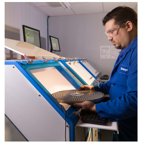
More than 500 samples can be characterized in as little as 5 days to inform well completion and other critical decisions.