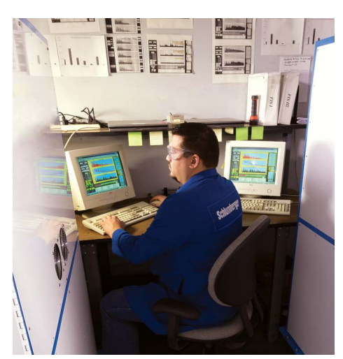
PetroFecta analysis is based on proprietary mass spectrometry equipment and a sample introduction process.