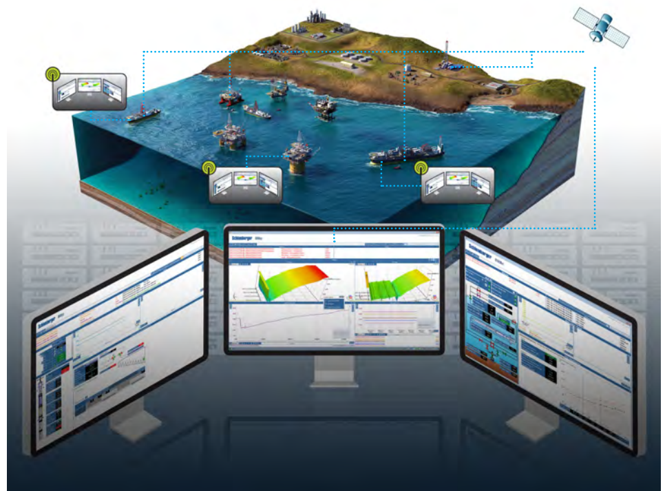
Typical RTAC system architecture enables data viewing and equipment control directly at the wellsite or remotely.

RTAC system software is based on SCADA software that is widely deployed in many different industries worldwide. Extensively supported and mature, it meets the robustness and long-term sustainability requirements of successful SCADA systems.