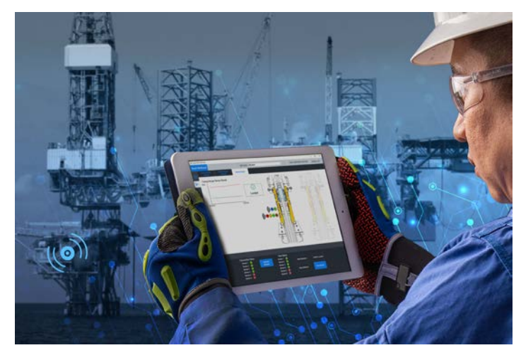
The wellhead installation digital position sensing solution unambiguously confirms correct landing positions.

The conventional method used to ensure that each component of the wellhead system is installed properly is manual and subjective: conducting space-out from the rig floor, marking landing joints and using weight indications, and opening side outlet valves to check the marks on internal components. This task sequence for physically measuring the landing joints from the rig floor to the internal wellhead profile of each component is typically done in constrained spaces and introduces the risk of openhole operations when performing visual inspections through the side outlet valves.